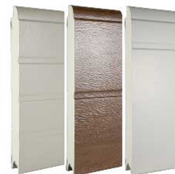
GARAGE DOOR PANEL