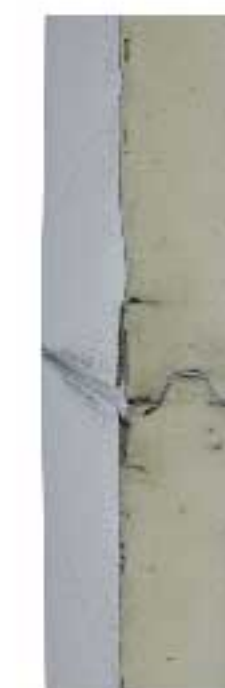
USA NO GAP