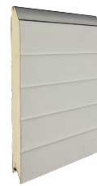
INDUSTRIAL DOOR PANEL